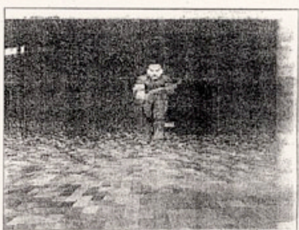
Miltos Manetas' "After Doom #6," 1997.

Tobias Bernstrup offers up a Lara Croft for the new millennium with his video piece "In the Dead of Night," which features a female avatar walking the empty streets of a digital city after dark. Void of action-hero bravado, but full of