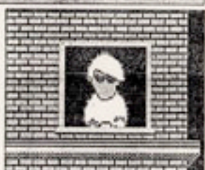
For his "I Shot Andy Warhol" piece, Cory Arcangel hacked into an early Nintendo game cartridge and created his own version with characters that resemble the pope, Col. Sanders, Flavor Flav and Andy Warhol (above).

Miltos Manetas also used a classic computer game as inspiration, but instead he has chosen scenes from "Doom" to create single still images of "landscapes"